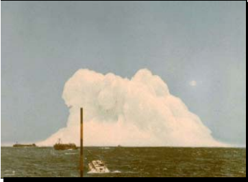
Depth Bomb Test

Operation Wigwam consisted of a single nuclear detonation, conducted 400 - 500 miles SW of San Diego, California (about 29 Deg N, 126 Deg W) on May 14 1955. It was a deep water test, -2,000 ft (the ocean is 16,000 feet deep at that point) to investigate the vulnerability of submarines to deep nuclear weapons, and the feasibility of using depth bombs in combat (there was considerable concern about problems with surface contamination). The test device was a B-7 (Mk-90) Betty depth bomb that was suspended by a 2000 ft cable from a barge. The dry weight of the bomb was 8250 lb, 5700 lb when submerged.