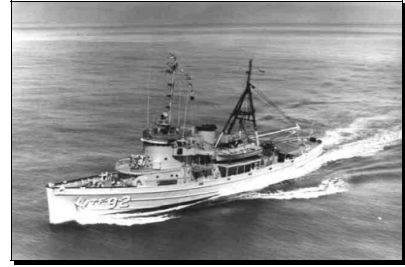
USS TAWASA (AFT-92)

6800 personnel on 30 ships, including USS FRANK E EVANS (DD 754) , participated in Wigwam. A 6 mile tow-line connected the fleet tug, USS TAWASA (AFT-92) and the shot barge. Suspended from this line at varying distances from the barge were three "Squaws," sub-scale submarine like pressure hulls equipped with instruments and cameras.