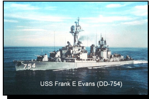
USS Frank E Evans (DD-754)